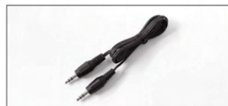
● CO-mini Data cloning cable (AR-Mini to AR-Mini)