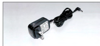
● AA-mini "A" plug type replacement AC adapter (100~240V, 6V DC, 500 mA)