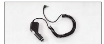
● DC-mini DC cable with cigar-lighter plug (6V DC, 500 mA for 12/24V socket)