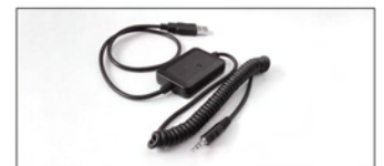
● PC-mini PC cable (USB only)